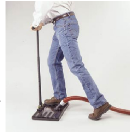
Water Claw pulls water from the carpet padding

Call us for 24 hour flood damage cleanup at